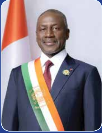
Speaker of the National Assembly of Côte d'Ivoire