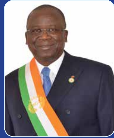
President of the Senate H.E.M. Jeannot AHOUSSOU- KOUADIO

However, some senators do not belong to either of these two (2) parliamentary groups. They are non-attached senators.