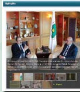
Photo Gallery of the last activities of the PUIC